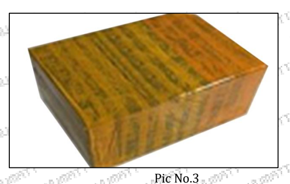
International express packaging: Wrapped with yellow tape after wrapping black protective film

Mob/Whatsapp: +86 13410541523 Tel: +8675523215133 Email: ruby@shumatt.com